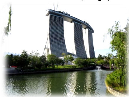
Sands Hotel, Singapore